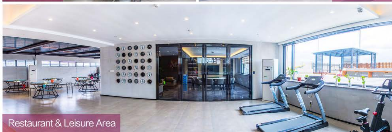
Restaurant & Leisure Area